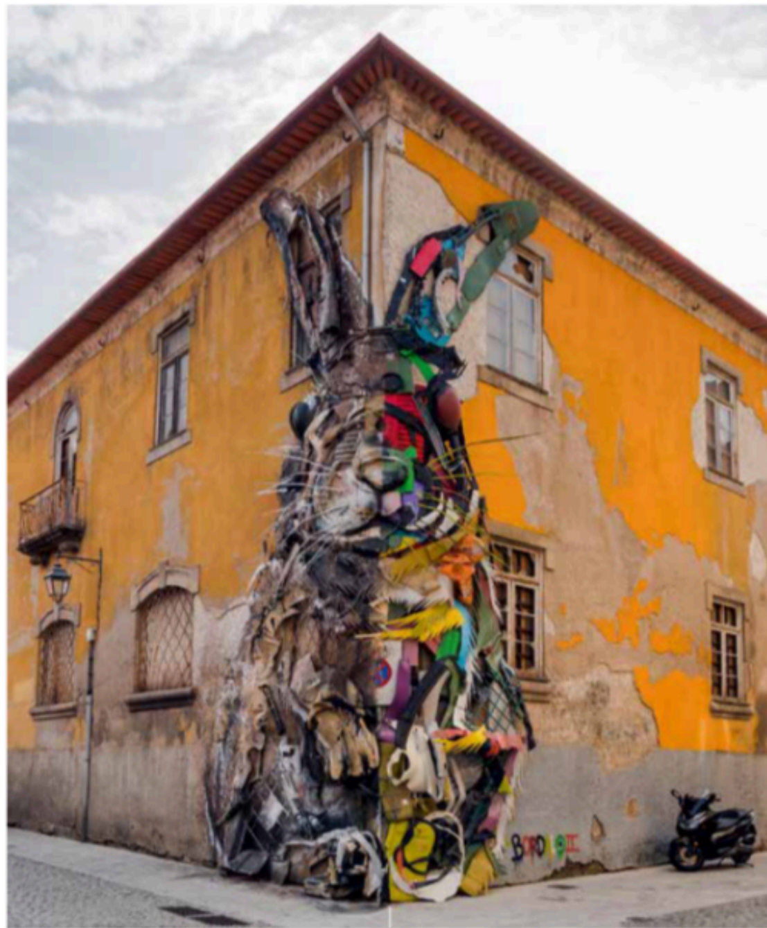
Vila Nova de Gaia, Portugal

Long famed for its port wine cellars and coastal allure, the city of Vila Nova de Gaia has more recently become known for its street art, too. Since 2017, the corner of a weathered building on R. Dom Afonso III has housed Half Rabbit : a rabbit sculpture made from a jumbled mosaic of city waste, disguised in rabbit hues on one side and left in its original bright colours on the other. Created by the acclaimed street artist Bordalo II, this visual metaphor confronts us with the impact of the 'take-make-waste' linear economic model wreaking havoc on our environment by using resources to produce goods that usually end up in landfills. Did you know? The colossal work can be seen from the Gaia Cable Car, which runs alongside the Douro River.