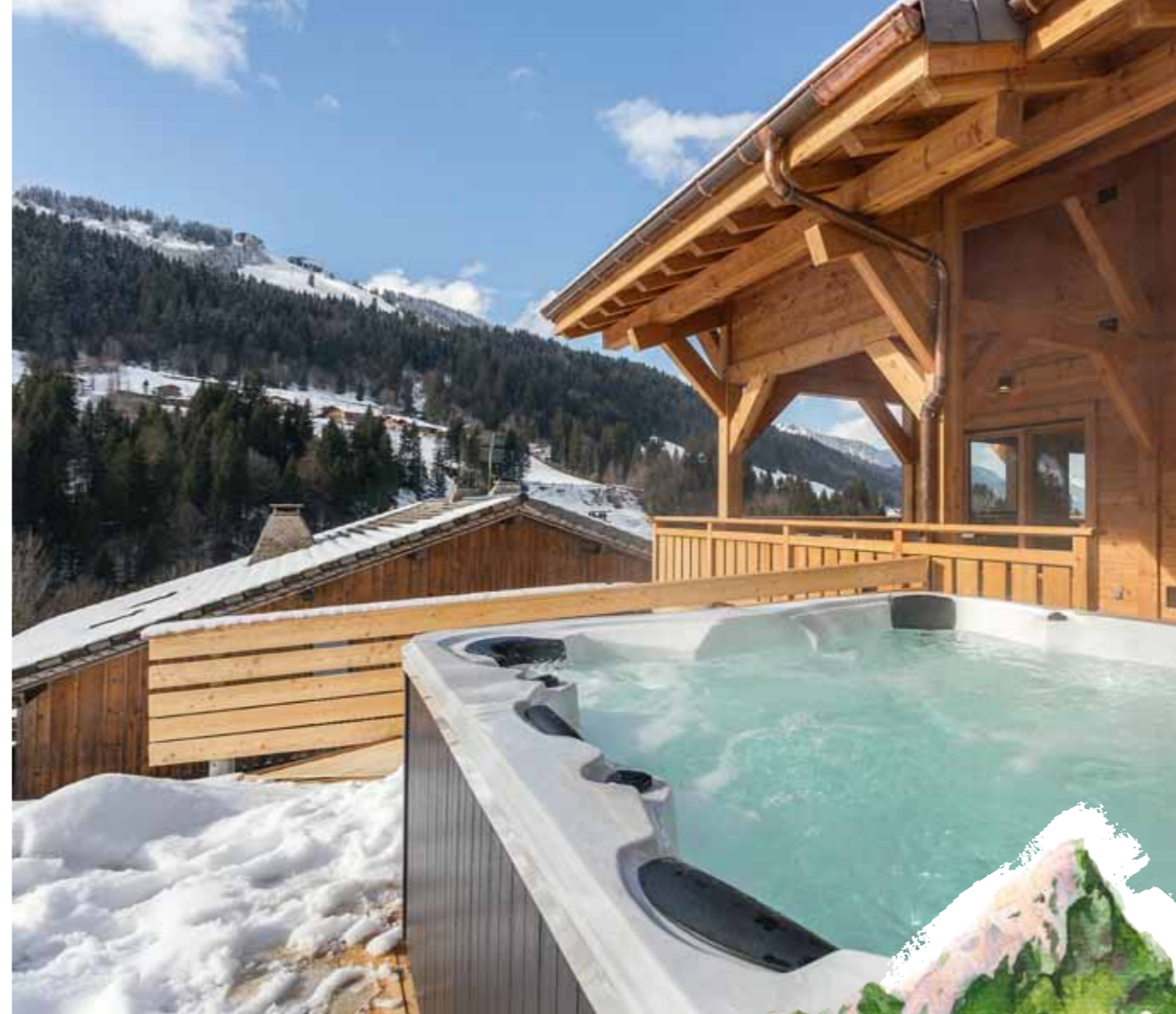
Above and right: Accommodation includes stylish apartments, cosy chalets and spacious farmhouses